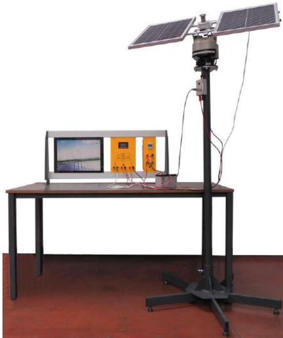
DL SUN-TRACKER (bench not included)

For the study of the operation of a solar panel that follows the sun light direction thanks to a motor system.